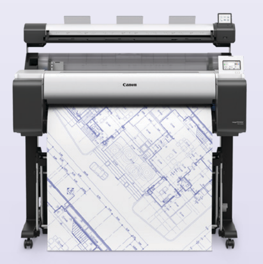
TM-5350 MFP Lm36