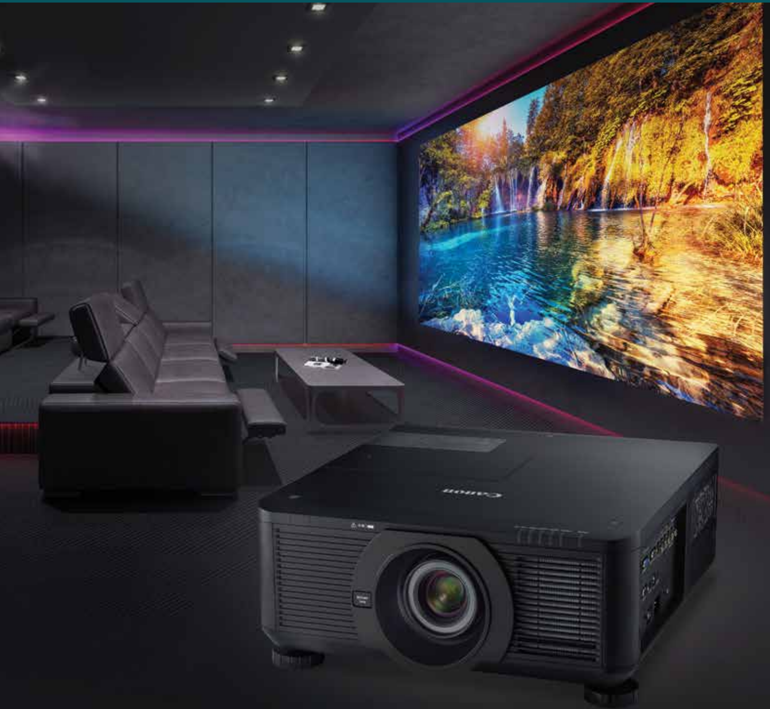
LX-MU700 MULTIMEDIA PROJECTOR