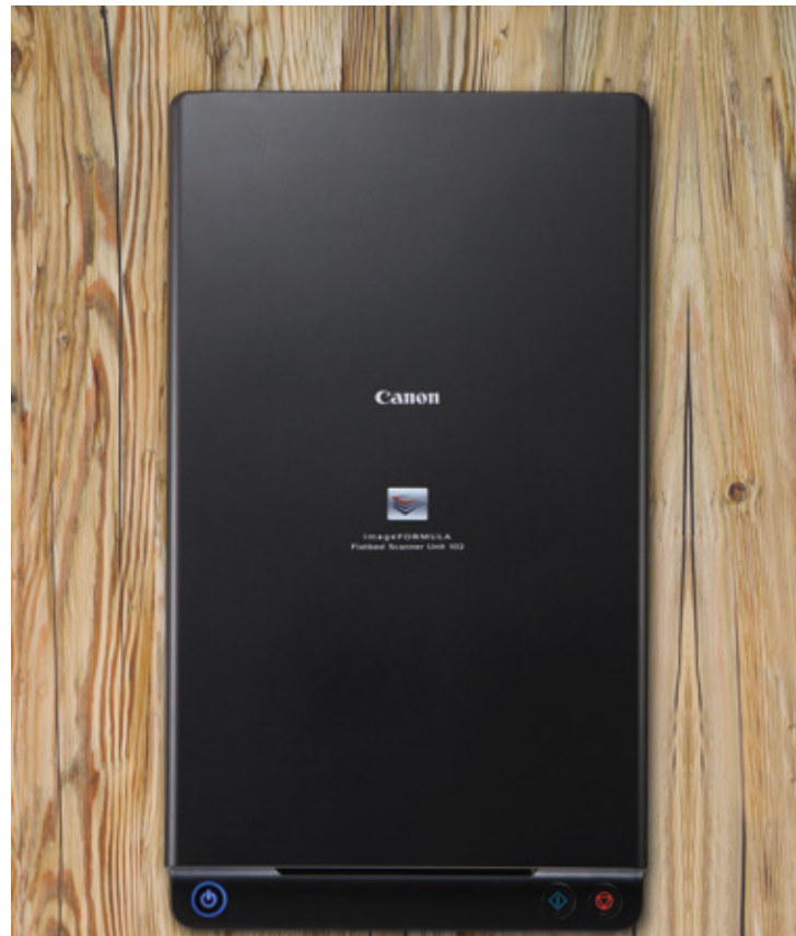
Flatbed Scanner Unit 102